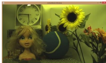
Camera Tool view mode