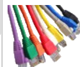
Ethernet Cat-6 Gigabit Patch Cable