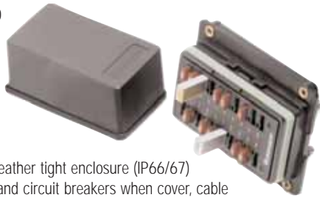
Shown with deep cover. Fuses and circuit breakers sold separately.

The RTMF offers a weather tight enclosure (IP66/67) for ATM blade fuses and circuit breakers when cover, cable seals, and cavity plugs are installed.*