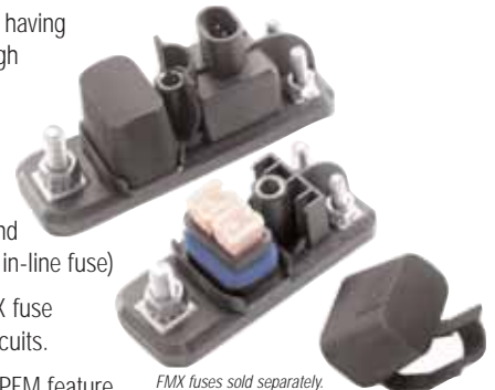
FMX fuses sold separately.

Electrical terminations not supplied by Cooper Bussmann.