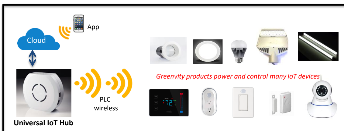
Smart LED Lighting Control with Sensor Network

For more information, please contact Greenvity