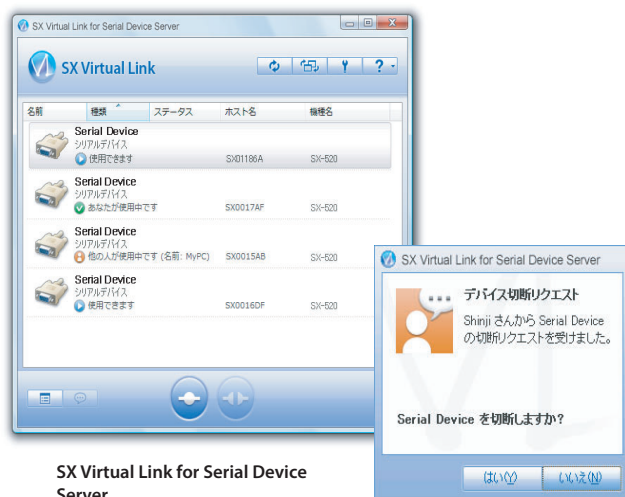
SX Virtual Link for Serial Device Server