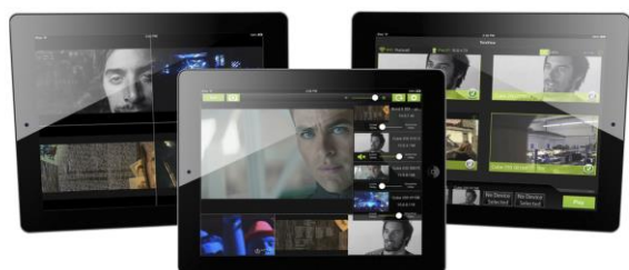
Wireless HD video streaming

The SPB209A is highly integrated and its complete system functionality, means quicker design cycles, lower risk and simplified manufacturing, all in a ultra-small package. The SPB209A delivers a complete and fully tested implementation of 802.11 a/b/g/n/ac, BT4.2 and NFC functionality. The SPB209A solution is calibrated and FCC, CE certified resulting in lowest possible customer production and system cost.