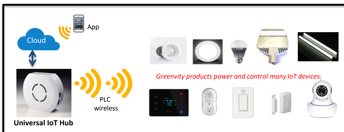
Smart LED Lighting Control with Sensor Network

For more information, please contact Greenvity