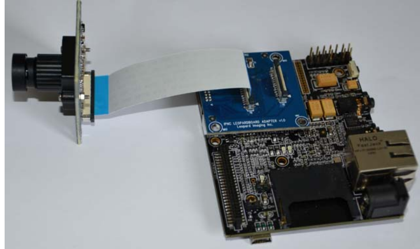
LI-CAM-M034 WITH Leopardboard 36x