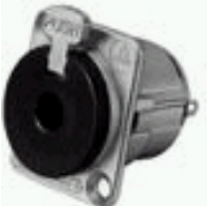
Click here for 1/4" Jacks