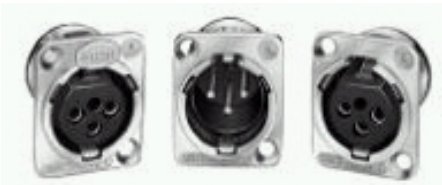
Click here for full line of E Series XLRs

+ Reversible gender. ~ Connector is flush with the face of the housing. If no "B" suffix, all connectors come with nickel housing. If no "PKG" suffix, all connectors come bulk.