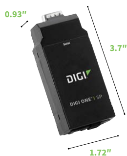
DigiOne® SP - FRONT

For a full list of accessories, visit www.digi.com