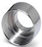
Step-up adapter, M20 to M25, including O-ring

Extension adapter - ENLAR-M-KV-M20/M25 - 1647666