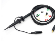
MCX Probe Kit (X1 X10) for DSO Quad