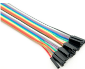
20 pin dual female splittable jumper wire - 300mm