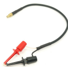
Digital Probe for DSO Quad