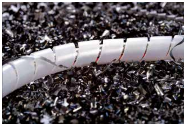
SBPA spiral binding made of polyamide offers excellent protection against abrasion.