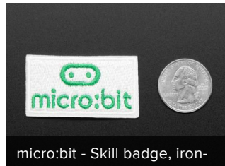
micro:bit - Skill badge, iron-