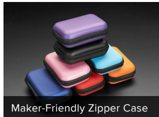
Maker-Friendly Zipper Case