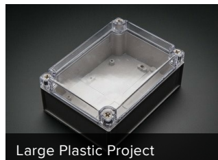
Large Plastic Project