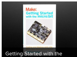
Getting Started with the