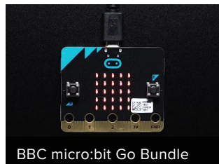
BBC micro:bit Go Bundle