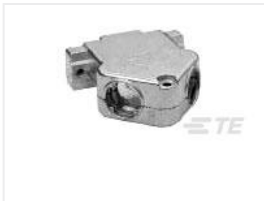
TE Part #1534811-1 HD20 COVER KIT 37 POS WITH CABLE CLAMPS