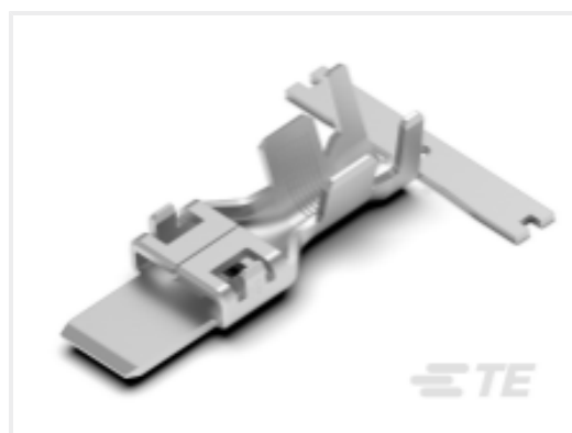
TE Part #2351982-5 DYNAMIC D8000 TAB CONT SILVER