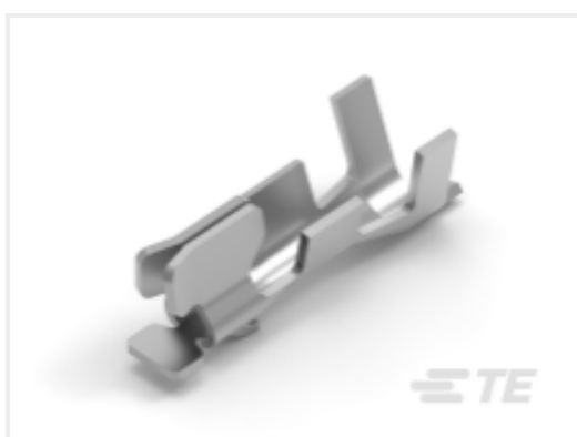
TE Part #2367199-1 1.0mm WT B Contact