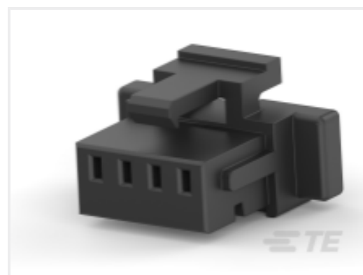
TE Part #2367198-4 1.0 WT B HOUSING WITH LATCH