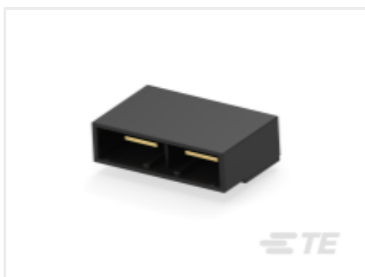
TE Part #1-2351965-2 Dynamic D8000 HDR ASSY 2PX BLK