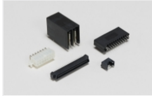
Standard Rectangular Connectors(96)