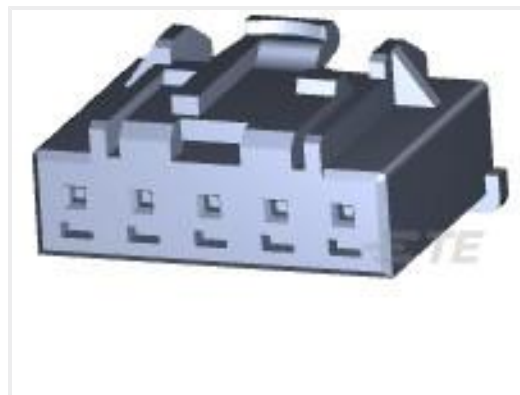
TE Part #5-1971793-1 NEW GI CONN 2.5 PLUG HSG 5P NC