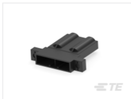
TE Part #1-2352216-2 DYNAMIC D8000 TAB HSG 2P