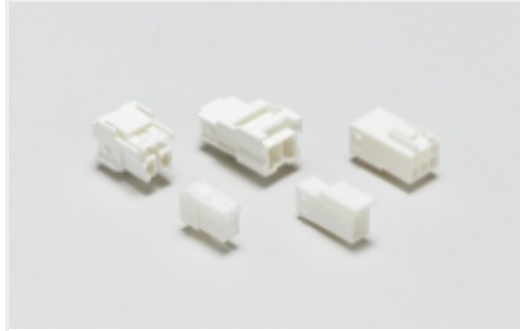
Rectangular Power Connectors(44)