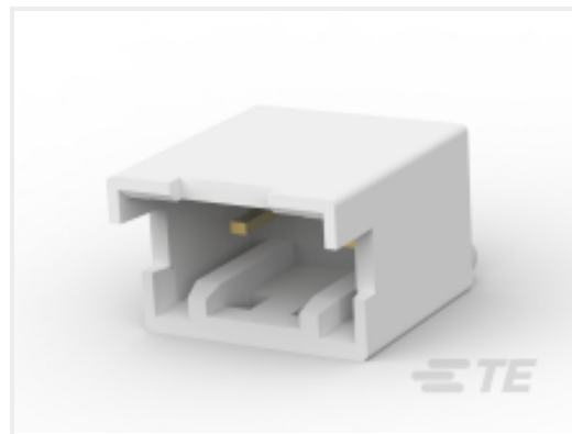
TE Part #CAT-G7534A-H342A Glow Wire Sig GRACE INERTIA Header