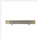
Mounting Bracket - DIN rail. Compatibility: WR41