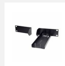
Digi CM 8 Rack Mount Kit, 19"