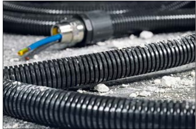
HelaGuard HG-SW for industrial applications.