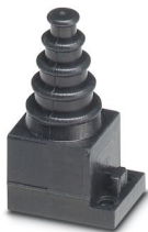
Cable sleeve, small, no. of conductors: 1, type: Round cable, closed, external cable diameter: 1x 2 mm ... 11 mm, material: NBR, color: black, length: 29.5 mm, width: 19.5 mm, height: 17 mm

Please be informed that the data shown in this PDF document is generated from our online catalog. Please find the complete data in the user documentation. Our general terms of use for downloads are valid.