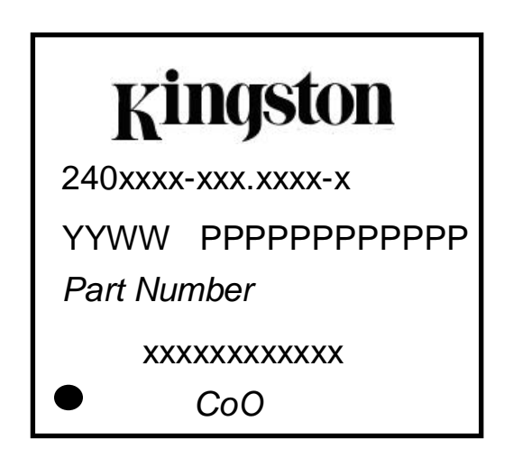
Figure 4 - EMMC Package Marking