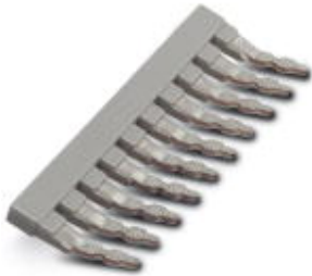
Insertion bridge, pitch: 8 mm, number of positions: 10, color: gray

Please be informed that the data shown in this PDF Document is generated from our Online Catalog. Please find the complete data in the user's documentation. Our General Terms of Use for Downloads are valid ( http://phoenixcontact.com/download )