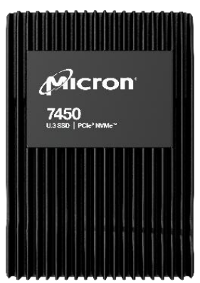
U.3: 7mm and 15mm

Designed as a mainstream solution, the 7450 SSD balances performance and density. Our offering includes a PCIe Gen4, M.2, 22 x 80mm with powerloss protection<sup>4</sup> and a 7.68TB E1.S that delivers industry-leading capacity.<sup>5</sup>