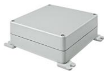
External Mounting Feet