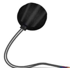
X1005243 – GPS/GLONASS (Active) & LTE 2-in-1 External Antenna