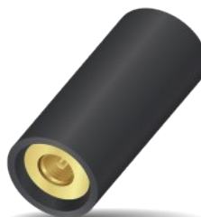
1002857 – EtherHelix™ Mission Critical GPS Antenna