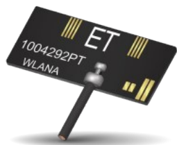
1004292PT – Wi-Fi Tunable PCB 5 GHz Embedded Antenna