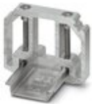
End clamp, for end support of UKH 50 to UKH 240, is pushed onto DIN rail NS 35 and fixed with 2 screws, width: 10 mm, color: aluminum