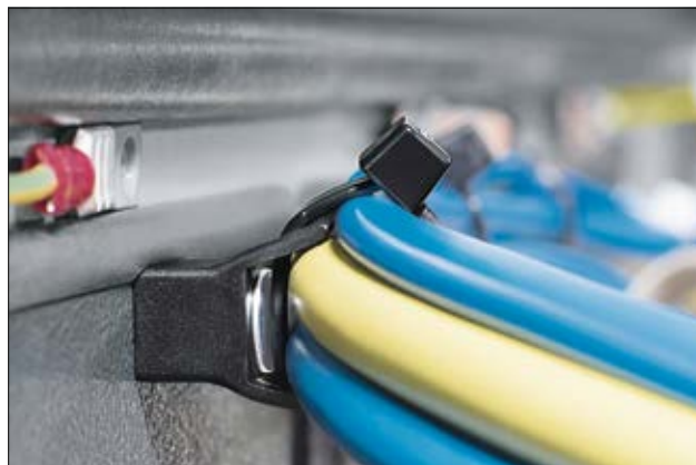
LOK02 fixing base application.