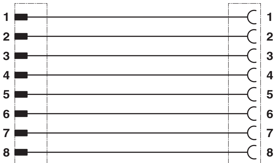
Contact assignment of the M12 plug and the M12 socket