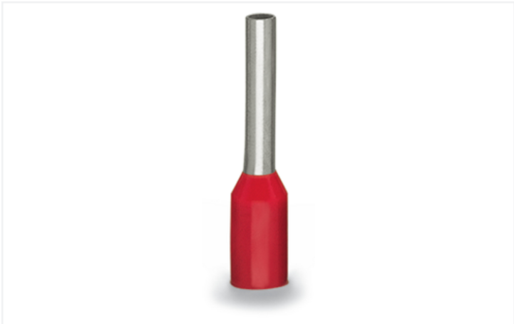
Color: ■ red