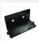
Mounting Bracket – Wall Mount