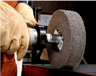
Works well on large surfaces

Our Scotch-Brite™ Multi-Finishing Wheel is ideal for producing #3 or #4 finishes on stainless steel (PDF, 845 Kb) and other metals (PDF, 13 Mb) on curved, contoured, and flat surfaces. The Multi-Finishing Wheel runs cool and resists loading due to its open-web construction, reducing the risk of part discoloration and warping while extending the life of the wheel. The Multi-Finishing Wheel is available in coarse, medium, and fine grade abrasive.