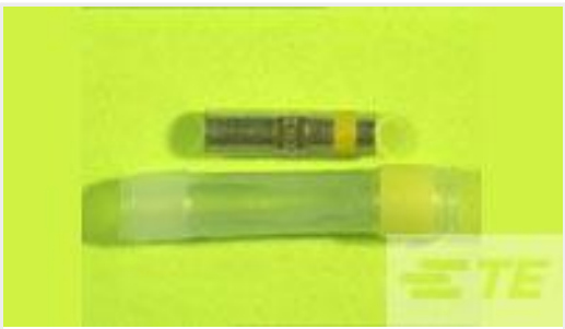
TE Part # 650075-000 D-436-37