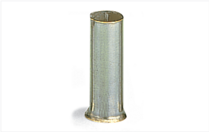
Color: ■ silver-colored