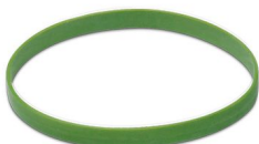
Color coding, color: green

https://www.phoenixcontact.com/us/products/1620588