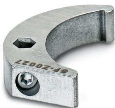
Hook wrench, series: RC

https://www.phoenixcontact.com/us/products/1607455