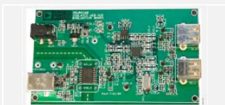
Figure 4. ADuM4160 Isolated USB Hub Evaluation Board