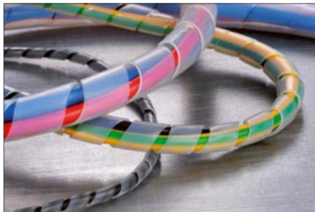
Spiral binding SBTFE - ideal for extreme conditions.