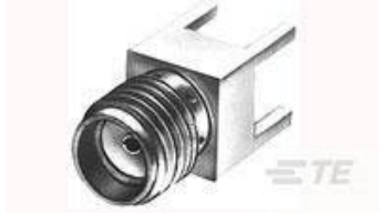
TE Part # 1053376-1 2062 8003 90