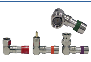
F-Conn Right Angle Compression Connectors