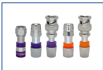
RGB/Mini Coaxial Connectors