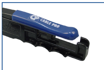
Linear Compliant Compression Tool (SLM)