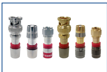
F-Conn Universal Connectors