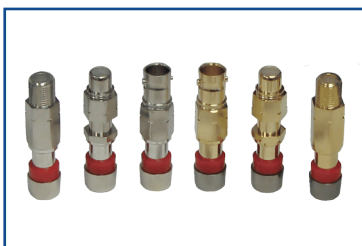
Standalone Splice (Female) Connectors