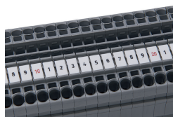
WMB "decade" marking