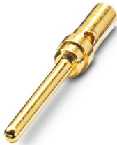
D-SUB crimp contact, connection method: Crimp connection, connection cross section: AWG 24-20

Please be informed that the data shown in this PDF document is generated from our online catalog. Please find the complete data in the user documentation. Our general terms of use for downloads are valid.