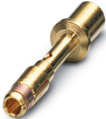
Crimp contact, turned, Single contact, contact diameter: 2 mm, crimp range: 1 mm 2 ... 2.5 mm 2

Please be informed that the data shown in this PDF Document is generated from our Online Catalog. Please find the complete data in the user's documentation. Our General Terms of Use for Downloads are valid ( http://phoenixcontact.com/download )