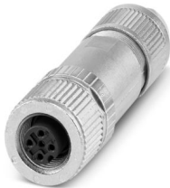
Data connector, CANopen®, DeviceNet™, 5-position, shielded, Socket straight M12, coding: A, Spring-cage connection, knurl material: Zinc die-cast, nickel-plated, external cable diameter 4 mm ... 8 mm

Please be informed that the data shown in this PDF document is generated from our online catalog. Please find the complete data in the user documentation. Our general terms of use for downloads are valid.