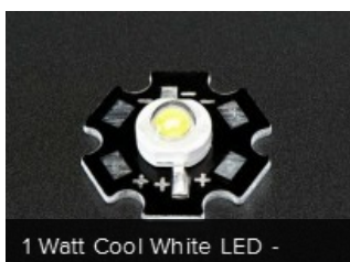
1 Watt Cool White LED -