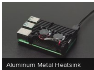
Aluminum Metal Heatsink