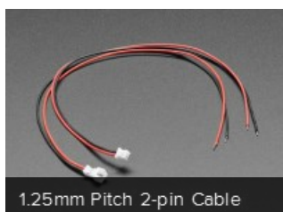
1.25mm Pitch 2-pin Cable