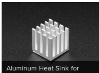
Aluminum Heat Sink for