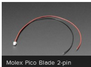
Molex Pico Blade 2-pin