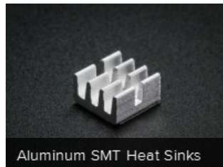
Aluminum SMT Heat Sinks