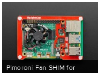
Pimoroni Fan SHIM for