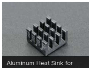
Aluminum Heat Sink for