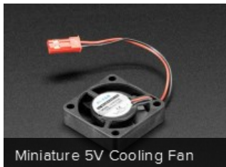
Miniature 5V Cooling Fan