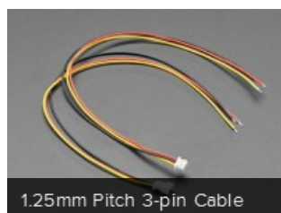
1.25mm Pitch 3-pin Cable