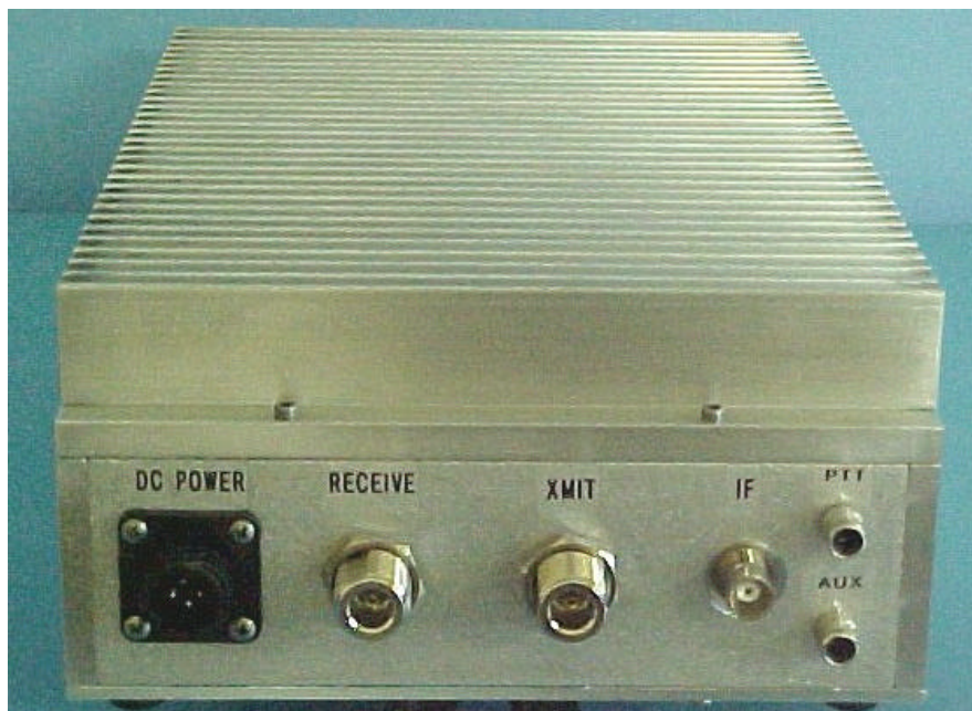
902/3-144 & 902/3-28 Back