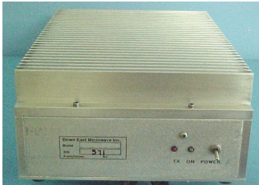
902/3-144 & 902/3-28 Front