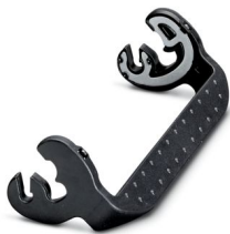
Replacement plastic single locking latch for standard housings of type B24

Please be informed that the data shown in this PDF document is generated from our online catalog. Please find the complete data in the user documentation. Our general terms of use for downloads are valid.