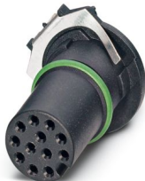
Contact carrier, 12-position, Socket, straight, M12, coding: A, PCB mounting, THR solder connection, Alternative product in accordance with RoHS II without Exemption 6c (Pb < 0.1 %) item no.: 1239761

Please be informed that the data shown in this PDF document is generated from our online catalog. Please find the complete data in the user documentation. Our general terms of use for downloads are valid.