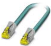
Patch cable, degree of protection: IP20, number of positions: 8, 10 Gbps, CAT6 A , cable outlet: straight

Patch cable - NBC-R4AC-R4AC-IE8A/.../... - 1411854