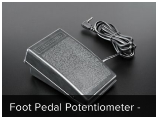
Foot Pedal Potentiometer -