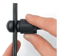
Installation on an insulated conductor with insulation displacement connection (IDC)