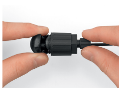
Integrated SIBA fuse to protect equipment and conductor