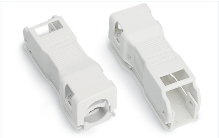
Color: ■ white