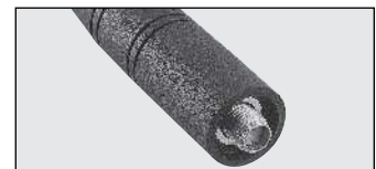
SMA F T3

SMA Female recessed insulator & partial (long) skirt (SFU type)