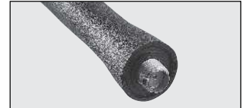
SMA F T2

SMA Female recessed insulator & partial (short) skirt (SFJ type)