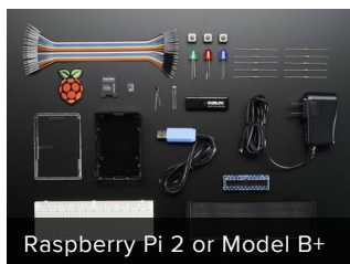
Raspberry Pi 2 or Model B+