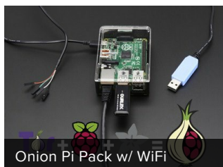
Onion Pi Pack w/ WiFi