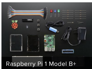
Raspberry Pi 1 Model B+