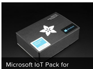
Microsoft IoT Pack for