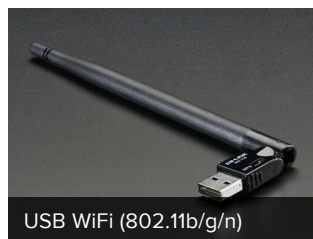
USB WiFi (802.11b/g/n)