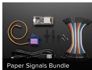
Paper Signals Bundle